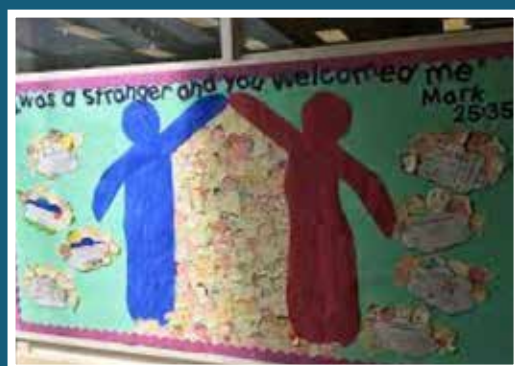
(St John's Infant School, The Wirral)

A selection of some of our wonderful school displays.