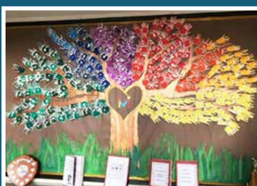
(Moorside Primary School, North Yorkshire)