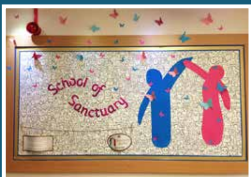
(Abingdon Primary School, Middlesbrough)