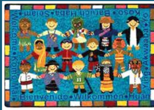
(Christ Church CE Primary School, Birkenhead)